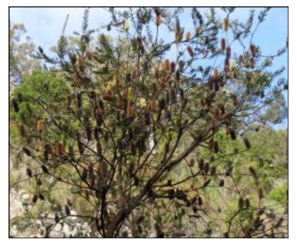
The Stoney Creek Banksia

The Highland Ramblers ventured to this almost inaccessible area some years ago, and again last year. The place is so steep that you have to slide on your bottom to get there, and crawl on your hands and knees to get out! Fortunately, seed was collected and the happy progeny are growing well on the roadside opposite Greg Young's gate (just past Highlands hall heading towards Caveat, on RHS of the road.) Nos (2) and (3) above are now no more, so old age catches up with us all eventually." Peg Lade