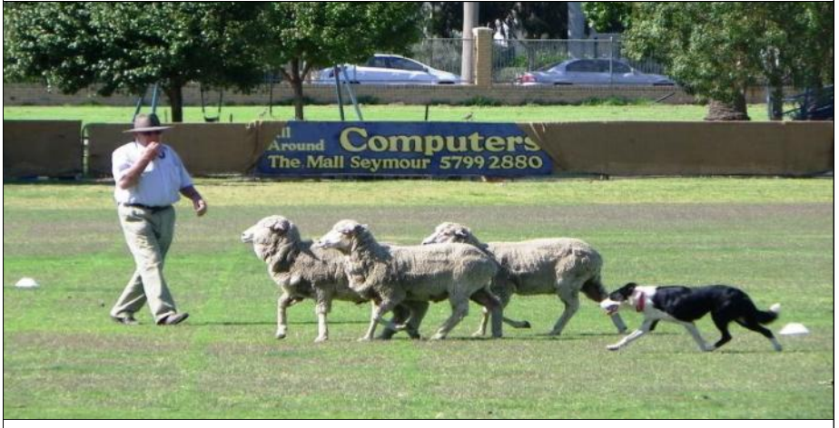
Three sheep are used for each competitor

The 48<sup>th</sup> Seymour Working Sheep Dog Trials will be held on Easter weekend. Triallers come from around Victoria and interstate to compete. Sheep are loaned by generous local farmers and 5 levels of competition are run Farmers— Encourage— Novice— Improvers—Open